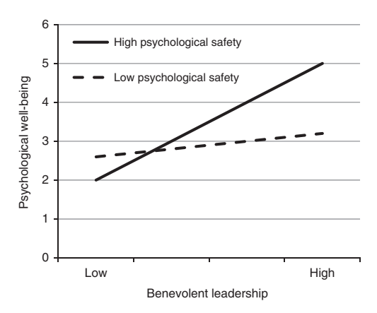
Figure 2. Interactive effects of benevolent leadership and psychological safety on psychological well-being

The results in this study suggest that researchers should continue to investigate psychosocial and contextual factors such as person-job fit (Vigoda-Gadot and Meiri, 2007), organization structure and size (Perry et al. , 1994), organizational politics (Davis and